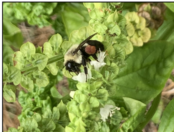
A bee stopped by the Mosaic Garden to sample the blooms on the basil.