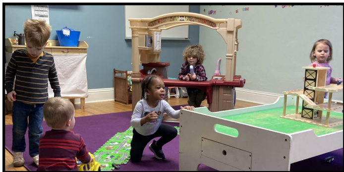
Playing together and having so much fun.