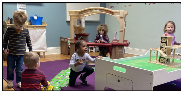
Playing together and having so much fun.