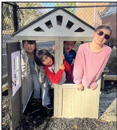
The kids were so excited!