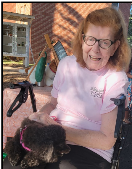
Blessing of the Animals