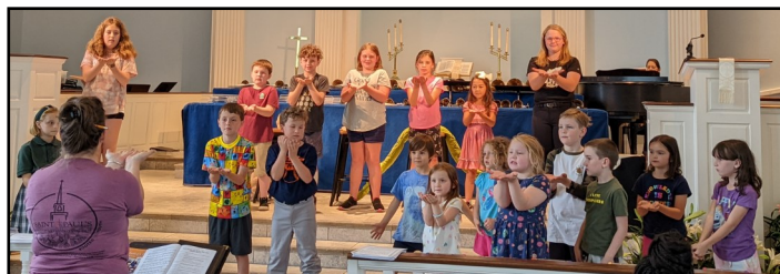
Kids@Art Musical Rehearsal

Kids@Art will be sharing some really good news at their end of the school musical, “The Sailor’s Bible,” on Wednesday, May 10, at 6:30 p.m. in the Sanctuary.