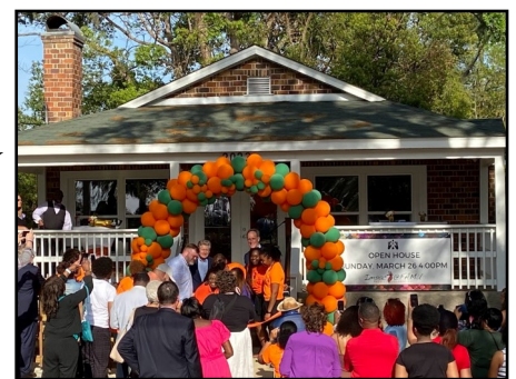
Impact FAMU Wesley Foundation Open House & Building Dedication on March 26

Your Missions giving supports the FAMU Wesley Foundation. Thank you for your faithful giving!