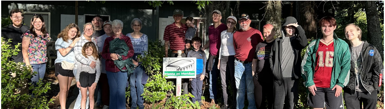
These Saint Paul's members served our food insecure neighborhood @ Manna on Meridian April 15, 2023

We are financially secure for the next few months. We will be partnering with Second Harvest- it will take several months to calculate how much that saves us.