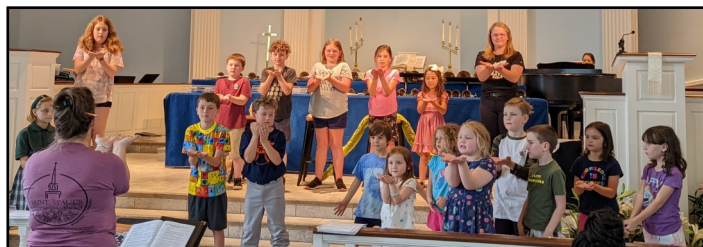
Kids@Art Musical Rehearsal

Kids@Art will be sharing some really good news at their end of the school musical, “The Sailor’s Bible,” on Wednesday, May 10, at 6:30 p.m. in the Sanctuary.