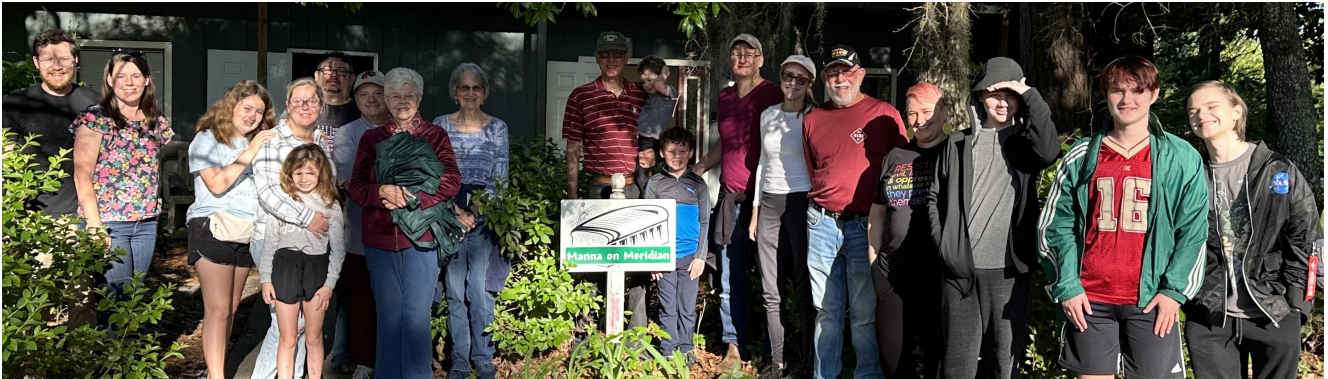
These Saint Paul's members served our food insecure neighborhood @ Manna on Meridian April 15, 2023

We are financially secure for the next few months. We will be partnering with Second Harvest- it will take several months to calculate how much that saves us.