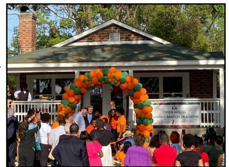
Impact FAMU Wesley Foundation Open House & Building Dedication on March 26

Your Missions giving supports the FAMU Wesley Foundation. Thank you for your faithful giving!