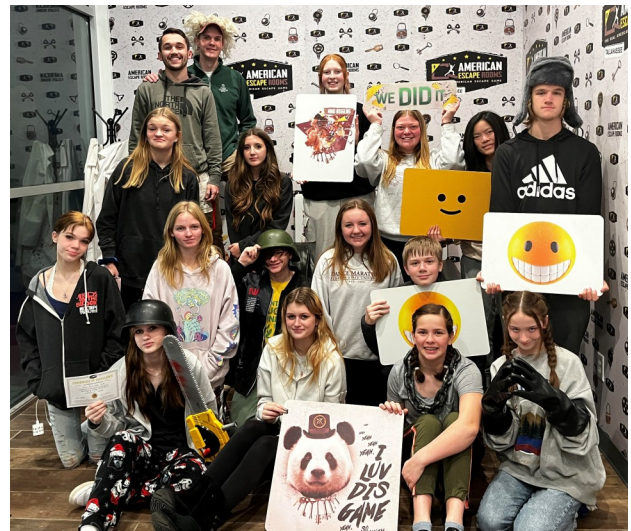
Youth Lock-In from January