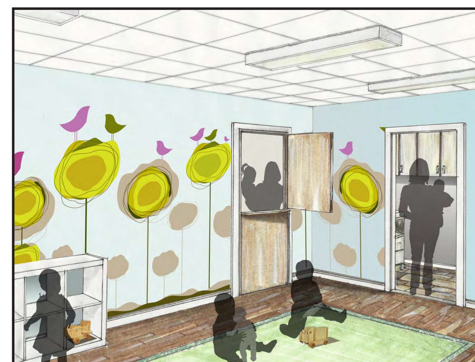
6 Months - 2 Years Old Classroom