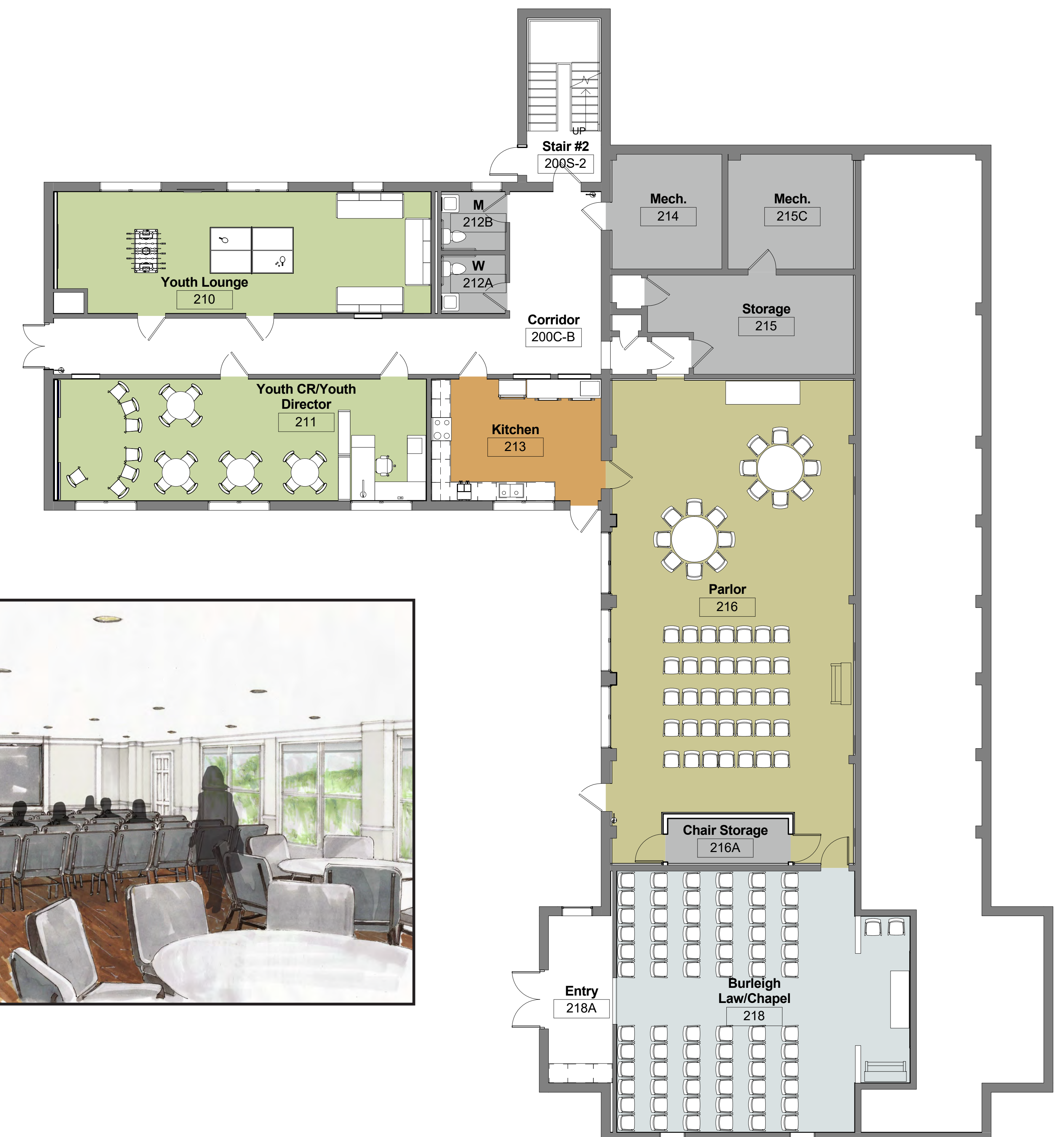
2nd Level Floor Plan